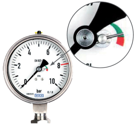
Limit indicator option with enlarged detail